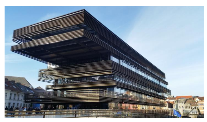
SCIFI-IT'2020 March 23-25, 2020 De Krook Ghent, Belgium