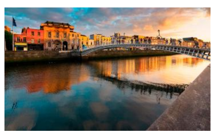
ISC'2020 June 8-10, 2020 UCD Dublin Dublin, Ireland