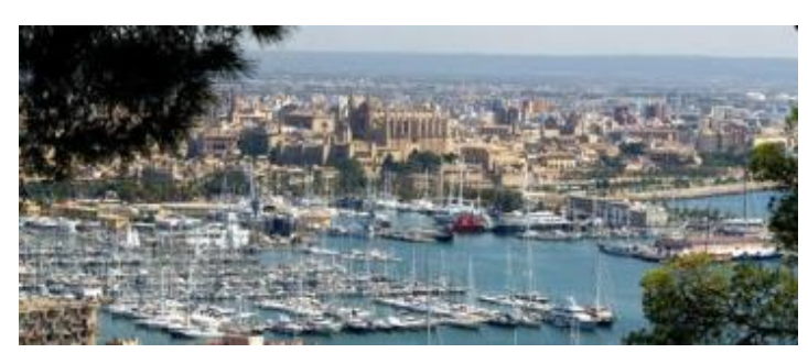
ESM'2019 October 28-30, 2019 Universitat de les Illes Balears Palma de Mallorca, Spain